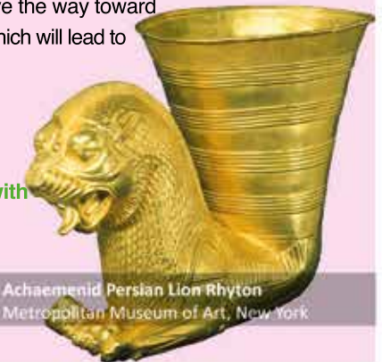
Achaemenid Persian Lion Rhyton Metropolitan Museum of Art, New York