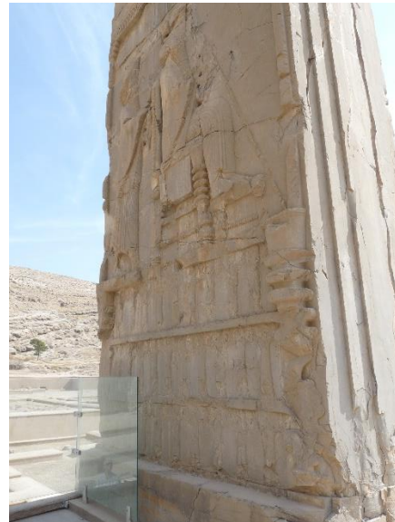
BEYOND THIS GATE AT TAKHT E JAMSHID

Zarathushtra studied Nature and he branded the knowledge he acquired from nature as 'Asha Vahista' 'The Ultimate Truth'. Truth is always the Truth and can be verified any time. These evidences are all based on facts and are verifiable.