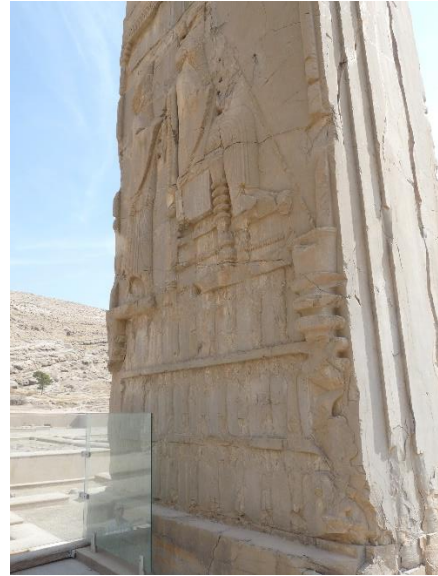
BEYOND THIS GATE AT TAKHT E JAMSHID

Zarathushtra studied Nature and branded the knowledge he acquired from Nature as 'Asha Vahista', 'The Ultimate Truth'. Truth is always the Truth and can be verified at any time. This evidence is all based on facts and is verifiable.