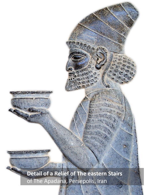
Detail of a Relief of The eastern Stairs of The Apadana, Persepolis, Iran

Truly, the Asha ( Ultimate Truth ) derived By the Good Mind Never before known Among the wise and all creation With it, make Good Rules and never waning Increasing Righteousness Leading us towards Perfection Zarathushtra – Gatha -Yasna Ha 28.3 (FR)