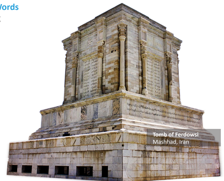
Tomb of Ferdowsi Mashhad, Iran

Sadeh is the 100th day of winter in the Arctic region & is a festival that has continued from the ancient Arctic homeland. The five month long