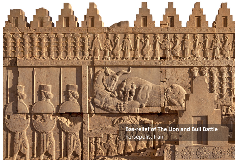
Bas-relief of The Lion and Bull Battle Persepolis, Iran

GOOD PRODUCTS -Products that are in harmony with nature