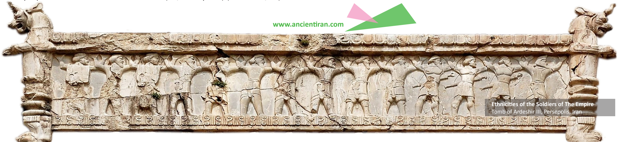
Ethnicities of the Soldiers of The Empire Tomb of Ardeshir III, Persepolis, Iran