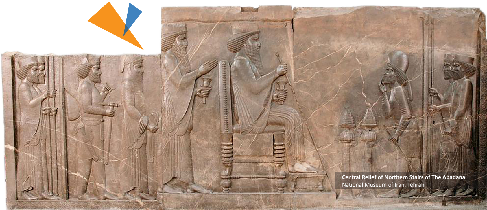
Central Relief of Northern Stairs of The Apadana National Museum of Iran, Tehran

of the coming of winter and so it is celebrated on 30 Mehr / Oct 22 just before the Arctic winter starts on the First of Aban.