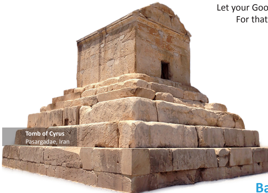
Tomb of Cyrus Pasargadae, Iran

ZARATHUSHTRA - GATHA - YASNA HA. 28.11 (FR)