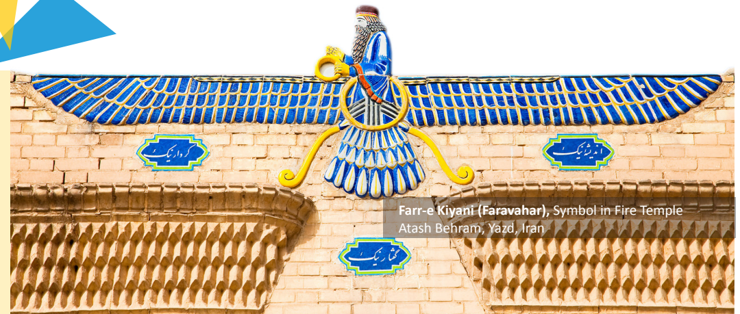
Farr-e Kiyani (Faravahar), Symbol in Fire Temple Atash Behram, Yazd, Iran

influenced civilizations and will keep on influencing it, to progress towards Perfection in harmony with Nature .