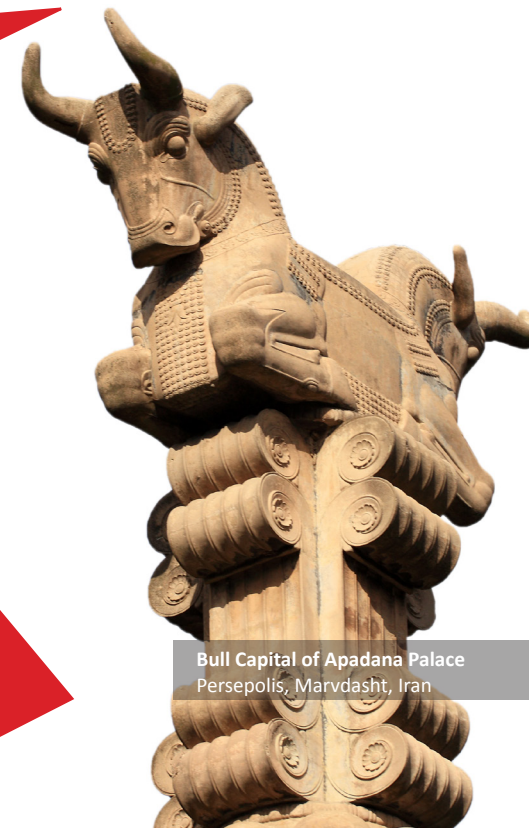
Bull Capital of Apadana Palace Persepolis, Marvdasht, Iran

After the Islamic invasion of Persia in the 7th century , there was a genocide of unmatched historical proportion that the victors have, to a great extent, tried to eliminate it from history. Coincidentally the Arab historian Tabari has recorded most of the atrocities. After gaining full control through genocide in the name of their God , they started a cultural genocide. They converted libraries and schools into mosques; they imposed their Arabic language and they cut tongues that spoke Persian and arms that wrote it. They imposed their inferior lunar calendar on the Iranians, in secret the Persians added to it some features like the name of the days, but over time the shorter lunar year had a disruptive effect. To escape the atrocities there was mass migration in all direction a small group landed on the coast of Gujarat in India and are today highly respected as Parses . They took with them the lunar calendar that had been imposed on them. They lost track of their ancient festivals especially because Gujarat did not have the distinct four seasons. It was too late when they realized the mistake. They got in touch with their brethren's in