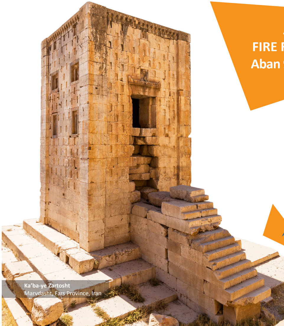
Ka'ba-ye Zartosht Marvdasht, Fars Province, Iran