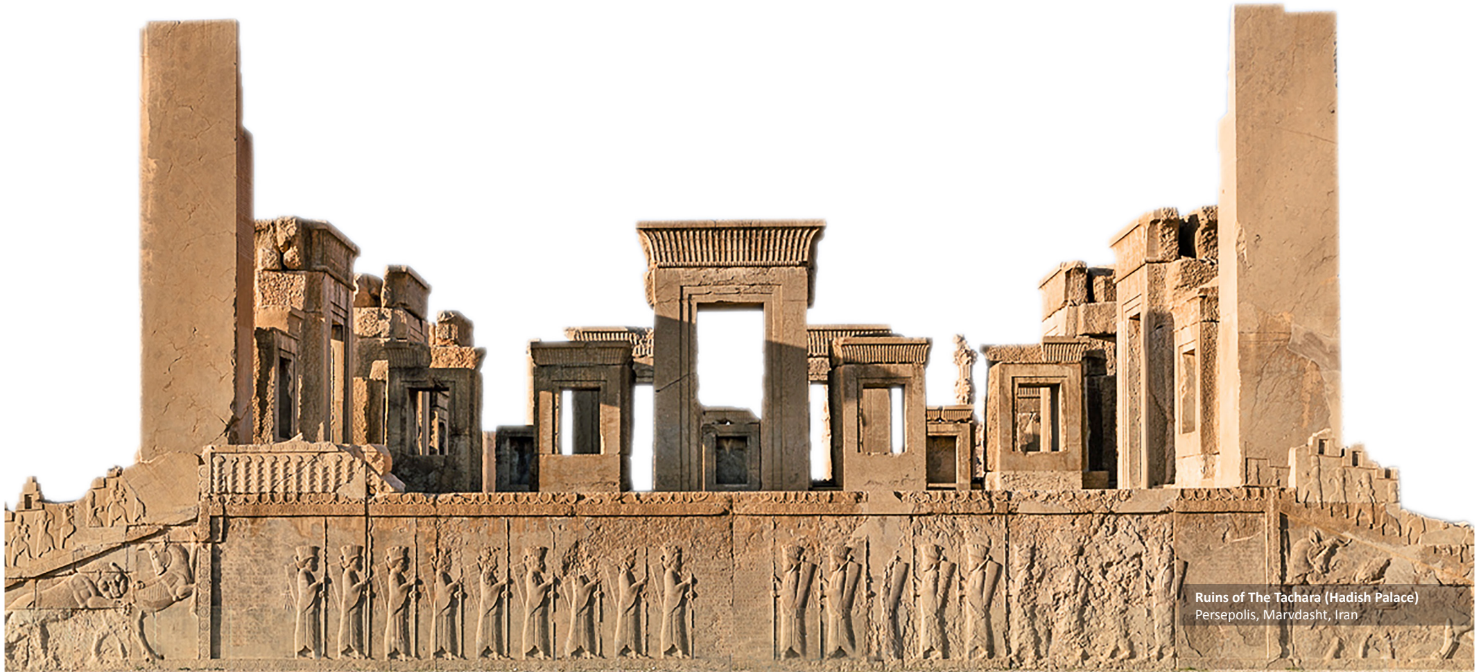
Ruins of The Tachara (Hadish Palace) Persepolis, Marvdasht, Iran

Even though the modern day pollutants did not exist in those ancient days the Zarathushtis endeavoured to keep their water clean and free of any pollutants.