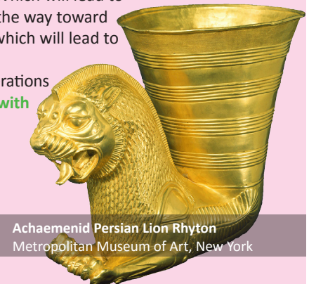
Achaemenid Persian Lion Rhyton Metropolitan Museum of Art, New York