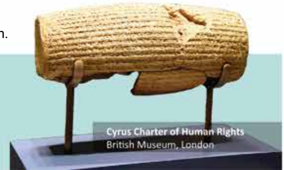
Cyrus Charter of Human Rights British Museum, London

THIS SHOWS THE IRANIANS KNEW OF THE MOVEMENT OF THE EARTH AROUND THE SUN OVER 2000 YEARS BEFORE GALILEO