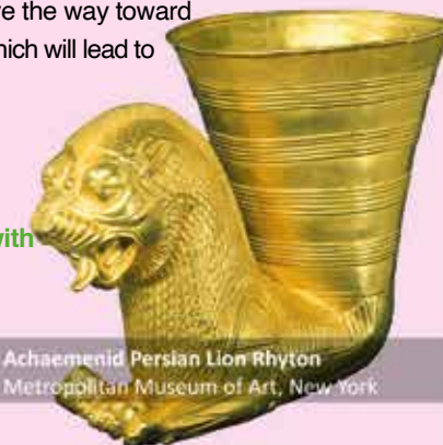
Achaemenid Persian Lion Rhyton Metropolitan Museum of Art, New York