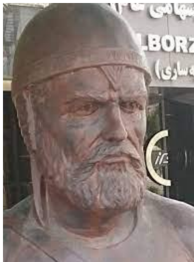
MAZYAR - in present-day Sari

Mazyar was brought to Samarra, where he was executed. His body later was gibbeted along with the body of Babak Khorramdin. Mazyar's brother Quhyar was shortly after killed by his Daylamite soldiers because he betrayed Mazyar. This marked the end of the Qarivand dynasty. This left the Tahirids as the rulers of Tabaristan, and Qarin I was restored as the ruler of the Bavand dynasty as a vassal. 15