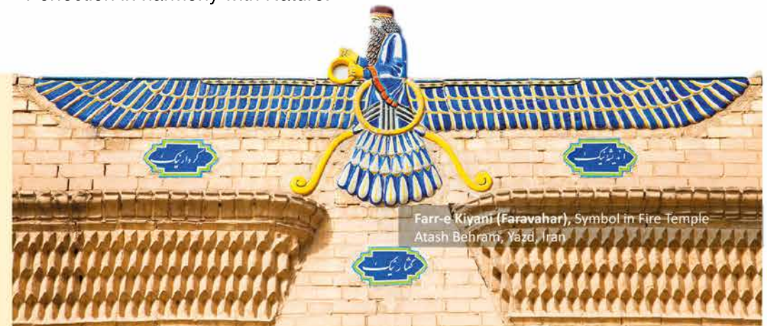
Farr-e Kiyani (Faravahar), Symbol in Fire Temple Atash Behram, Yazd, Iran

اینک جستجو می کنیم با پاس گزاری با برافراشتن دستها رسایی منش خرد را نخستین نیک افزای اشا همه بکوشیم نیک بآفرینیم با خرد اندیشی تا بدست آوریم هم سازی در جهان هستی و روانی زرتشت گات ها - یسنا - هات ۲۸ بند ۱ (ف ر)