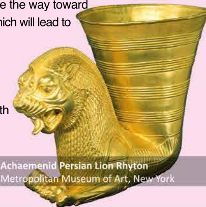
Achaemenid Persian Lion Rhyton Metropolitan Museum of Art, New York