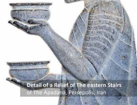
Detail of a Relief of The eastern Stairs of The Apadana, Persepolis, Iran

براستی آن اشا که سرچشمه گرفته، از منش نیک و پیش از این شناخته نشده میان دانایان و در هستی از آن است که راهنمایی خوب پدید می آید که هرگز به کاستی نمیروند و می افزاید پارسایی را و ما را بسوی رسای راهنمایی میکند زرتشت کات ها - یسنا - هات ۲۸ بند ۳ (ف ر)