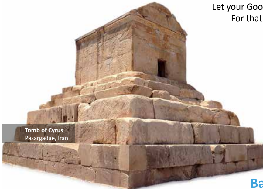
Tomb of Cyrus Pasargadae, Iran

ZARATHUSHTRA - GATHA - YASNA HA. 28.11 (FR)