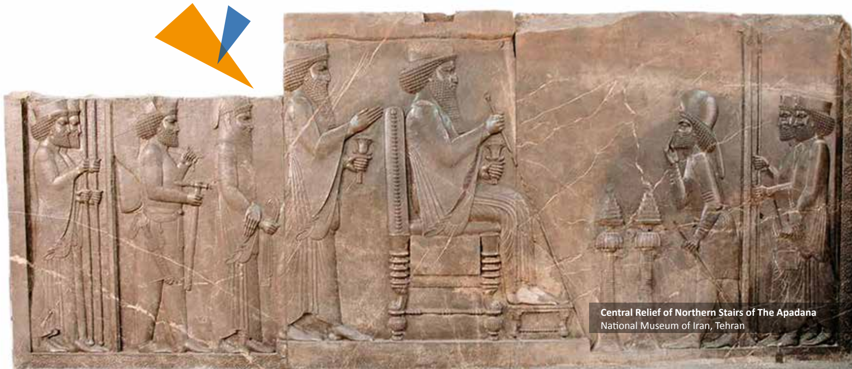
Central Relief of Northern Stairs of The Apadana National Museum of Iran, Tehran

of the coming of winter and so it is celebrated on 30 Mehr / Oct 22 just before the Arctic winter starts on the First of Aban.