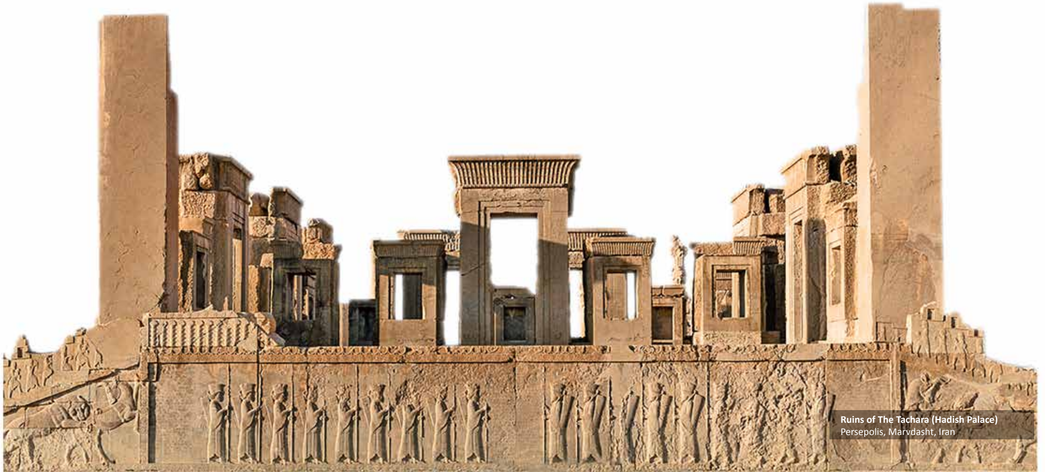
Ruins of The Tachara (Hadish Palace) Persepolis, Marvdasht, Iran

Even though the modern day polutents did not exist in those ancient days the Zarathushtis endeavoured to keep their water clean and free of any polutants.