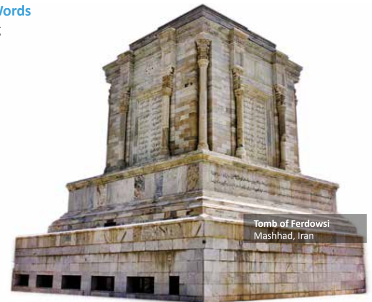
Tomb of Ferdowsi Mashhad, Iran