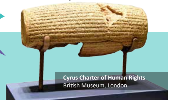
Cyrus Charter of Human Rights British Museum, London