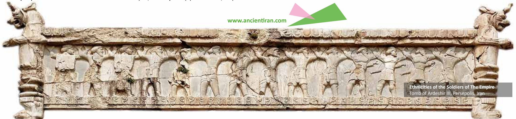
Ethnicities of the Soldiers of The Empire Tomb of Ardeshir III, Persepolis, Iran