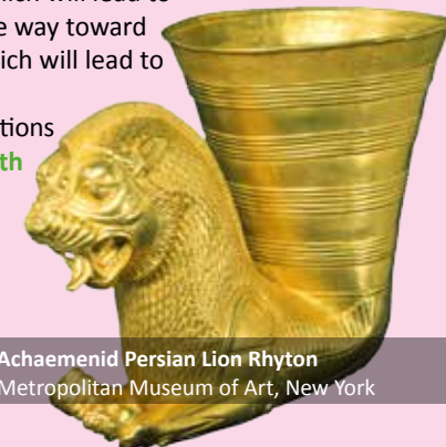
Achaemenid Persian Lion Rhyton Metropolitan Museum of Art, New York