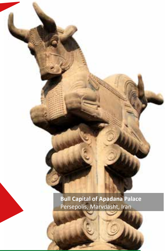
Bull Capital of Apadana Palace Persepolis, Marvdasht, Iran

After the Islamic invasion of Persia in the 7th century , there was a genocide of unmatched historical proportion that the victors have, to a great extent, tried to eliminate it from history. Coincidentally the Arab historian Tabari has recorded most of the atrocities. After gaining full control through genocide in the name of their God , they started a cultural genocide. They converted libraries and schools into mosques; they imposed their Arabic language and they cut tongues that spoke Persian and arms that wrote it. They imposed their inferior lunar calendar on the Iranians, in secret the Persians added to it some features like the name of the days, but over time the shorter lunar year had a disruptive effect. To escape the atrocities there was mass migration in all direction a small group landed on the coast of Gujarat in India and are today highly respected as Parses . They took with them the lunar calendar that had been imposed on them. They lost track of their ancient festivals especially because Gujarat did not have the distinct four seasons. It was too late when they realized the mistake. They got in touch with their brethren's in