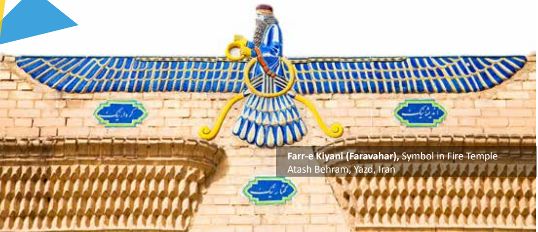
Farr-e Kiyani (Faravahar), Symbol in Fire Temple Atash Behram, Yazd, Iran

He passed away at a ripe age of 77 years . He practiced what he preached and achieved immortality with his Gathas which throughout history has