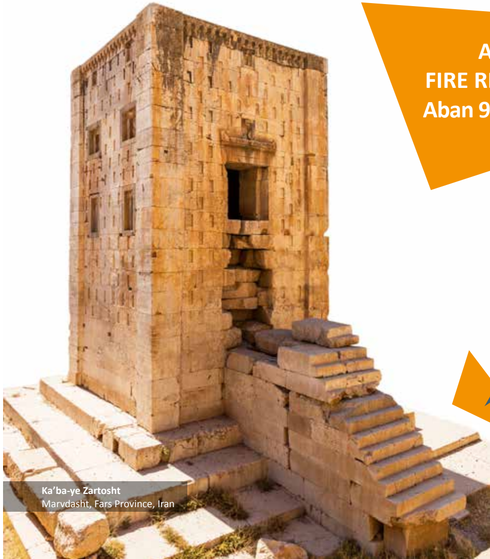
Ka'ba-ye Zartosht Marvdasht, Fars Province, Iran