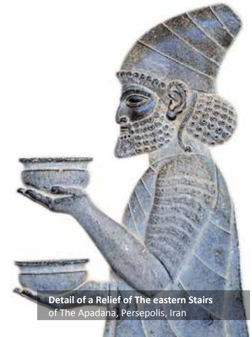
Detail of a Relief of The eastern Stairs of The Apadana, Persepolis, Iran

Truly, the Asha ( Ultimate Truth ) derived By the Good Mind Never before known Among the wise and all creation With it, make Good Rules and never waning Increasing Righteousness Leading us towards Perfection Zarathushtra – Gatha -Yasna Ha 28.3 (FR)